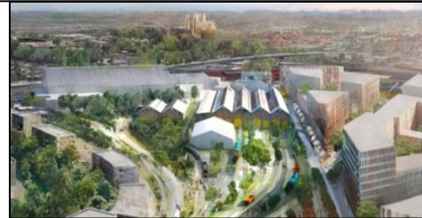
Construction & Infrastructure (including rail)