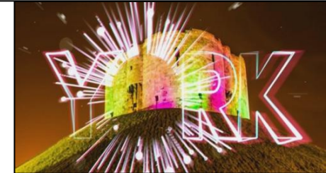
Hospitality & Tourism