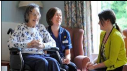
Health & Care

Harnessing the employment and career opportunities across all sectors for the benefit of all residents, with an immediate focus on