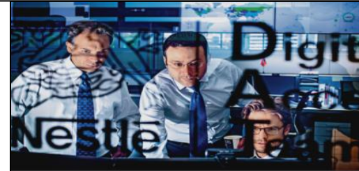
Digital, IT & Technology